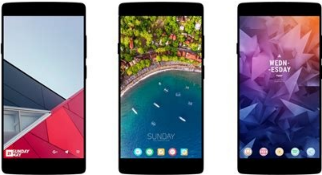
Get device model name android.